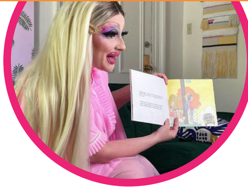
Dolly Pardon hosts a rainbow-themed Storytime at Home.

Increased investment in E-Library by 50% in April 2020