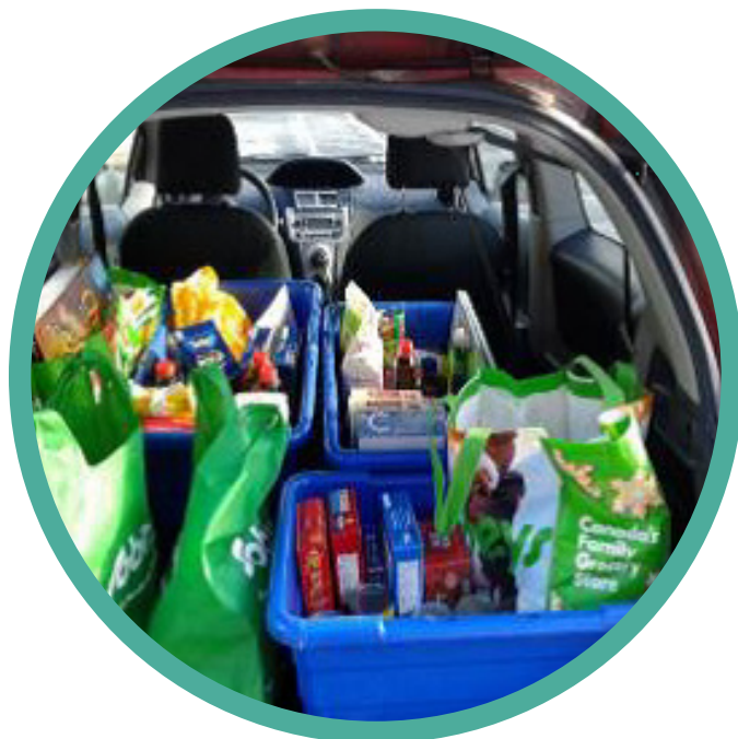
Loading the Library van up with donations for the Food Bank.

Once again, the Truro Library collected new mittens, hats, socks, and scarves for the infamous "Mitten Tree." The donations were then distributed to organizations in need throughout Colchester and East Hants.